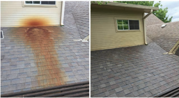
An example of rust removal improvements.

Soft washing is the safest solution. Professionals will dilute, divert, and decontaminate any runoff from the roof. Normally everything