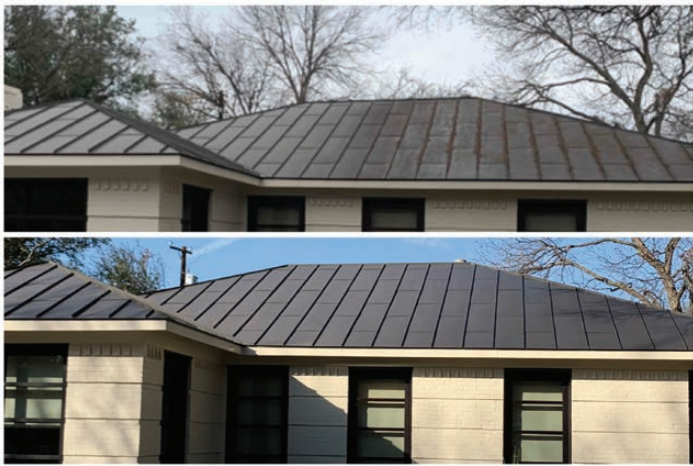
Another example of a roof before and after cleaning.

The best time for roof washing is at the start of fall and before winter. Soft washing is the best solution for cleaning all roof styles, such as asphalt shingles, terra cotta, slate, stone, and metal.